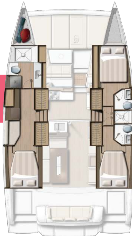
Owner's version 3 cabins and 3 baths Version propriétaire 3 cabines / 3 sdb